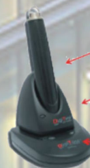
GC - 01 Reader